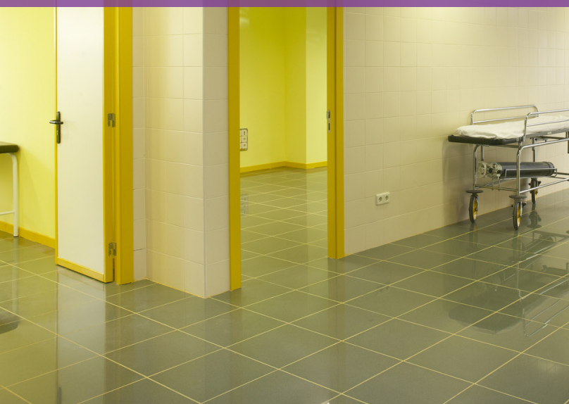
Hard Surface Cleaners