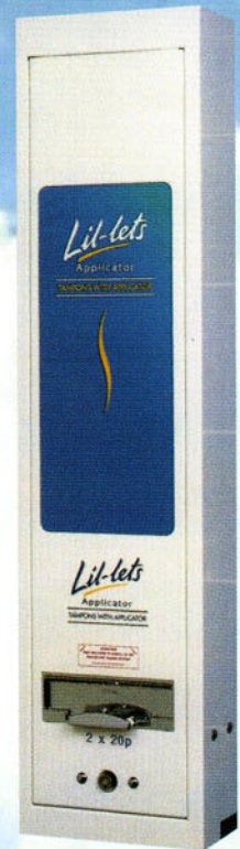
Single Column Vending