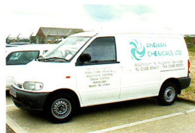
Specially adapted service vehicles