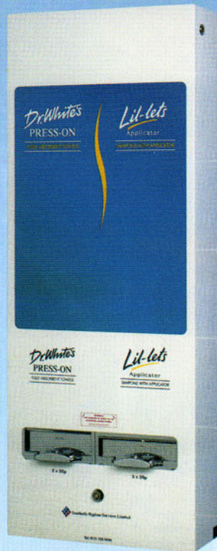
Dual Column Vending